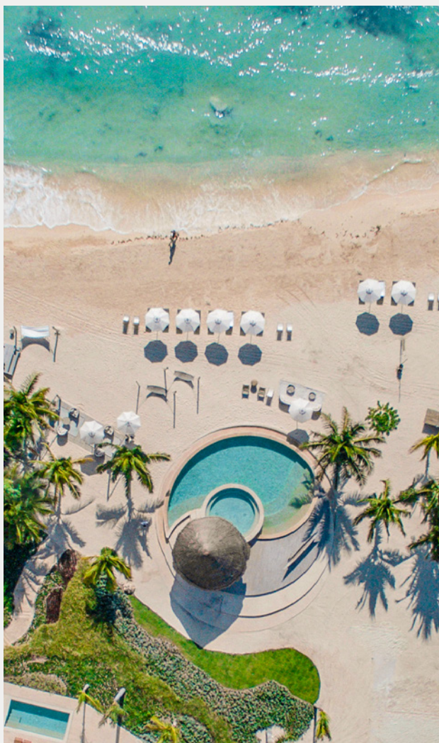
Costa Beach Club